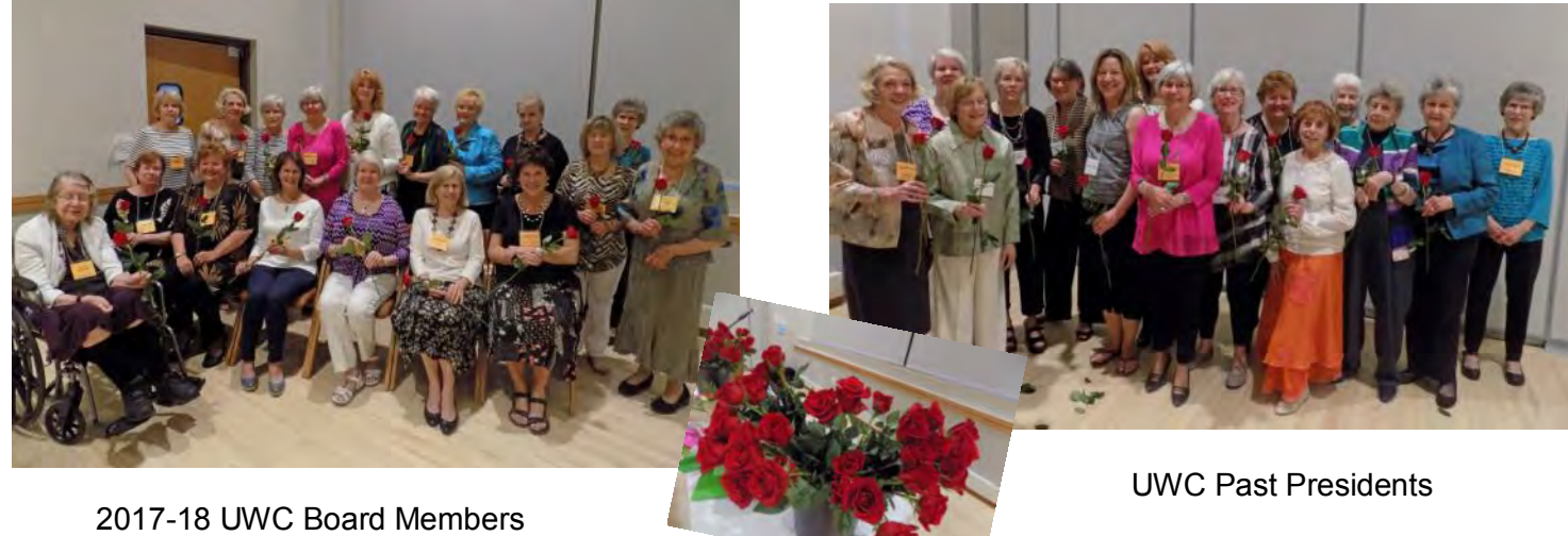
UWC Past Presidents' Awardees