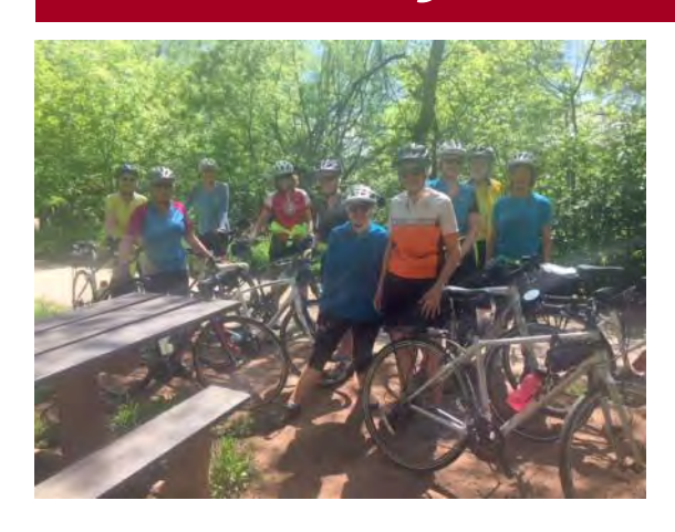
Bike Group (photos taken last Spring.)