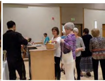
Wine for all