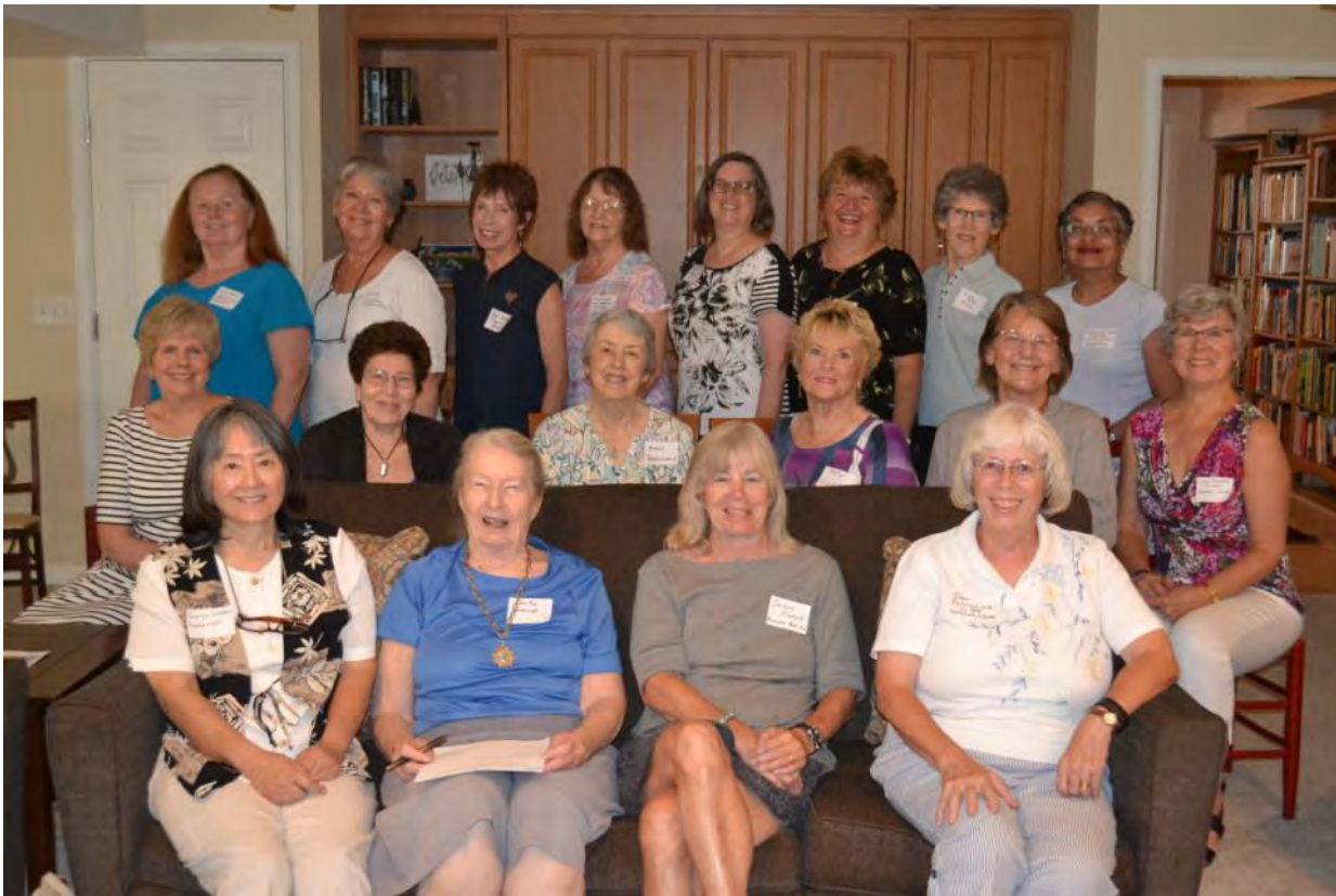
Interest Group Chairs 2018-19