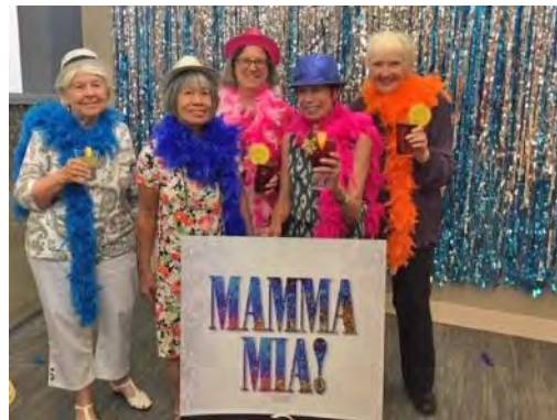
Theater Goers group at the recent production of Mamma Mia at the Arvada Center.