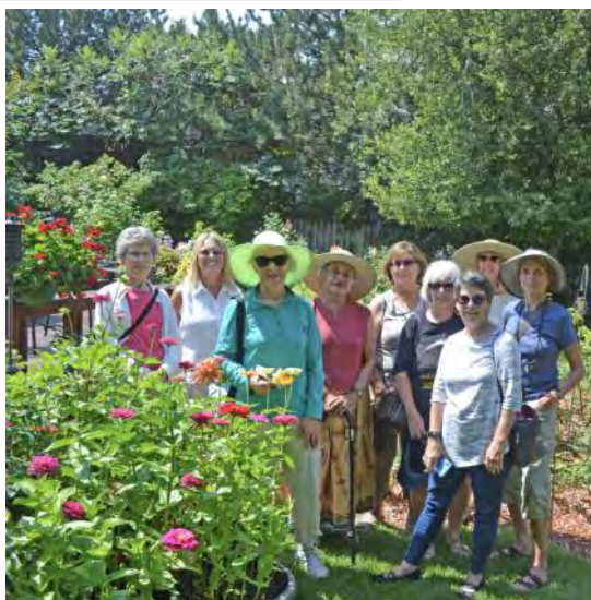
Garden Group at Lynn Nichols Rose Garden in Gunbarrel .

LUNGS: The world is getting hotter, there’s unrest overseas—the seas themselves aren’t very calm—one couple is thinking about having a child. LUNGS is a smart and funny drama that follows a couple through the surprising lifecycle of their relationship as they grapple with questions of family and change, hope, betrayal, happenstance, and the terrible pain that you can only cause the people you love.