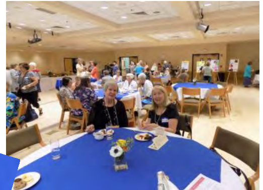
Ladies beginning to gather