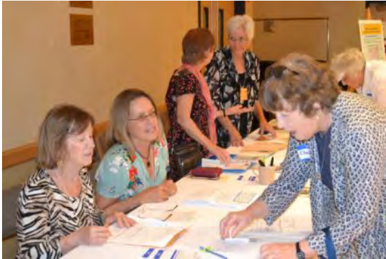
Signing up for lectures and memberships