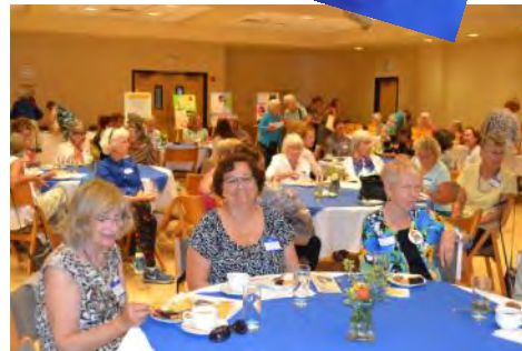
Room full of current and new members