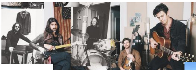
BAND OF HEATHENS