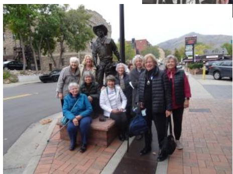
Theater Goers group at the recent production of LUNGS at the Miner's Theater in Golden.