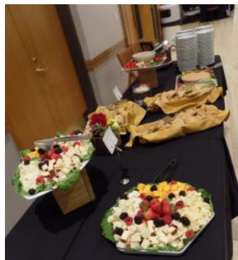
Appetizers were served and a salmon dinner too)

On Tuesday, October 9, 2018, the Lecture event featuring Dr. Temple Grandin drew a large crowd in the Glenn Miller Ballroom at UMC.