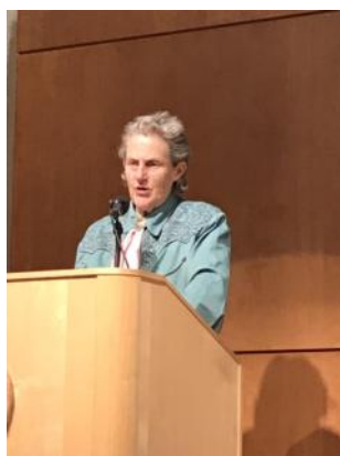
Dr. Temple Grandin, Speaker