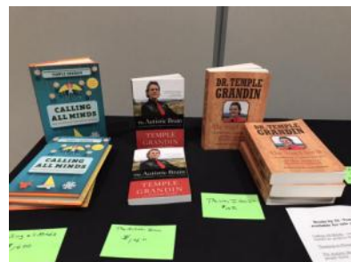
Dr. Grandin Books for sale