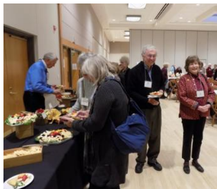
Appetizers were enjoyed