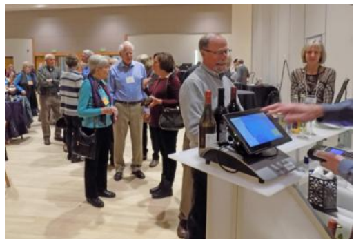
The line for wine and soda