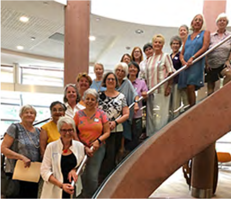
Our Interest Group Chairs met in August to get started on our new year

Our Interest groups are the heart of our activities every year. Please sign up at the Membership Tea/Coffee on September 13 th and find one or more groups of interest to you.