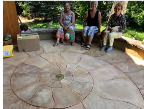
Garden Group in July Nautilus-chambered stonework