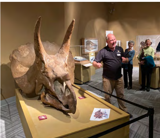
Triceratops – Too big to leave the building and return to the Smithsonian.