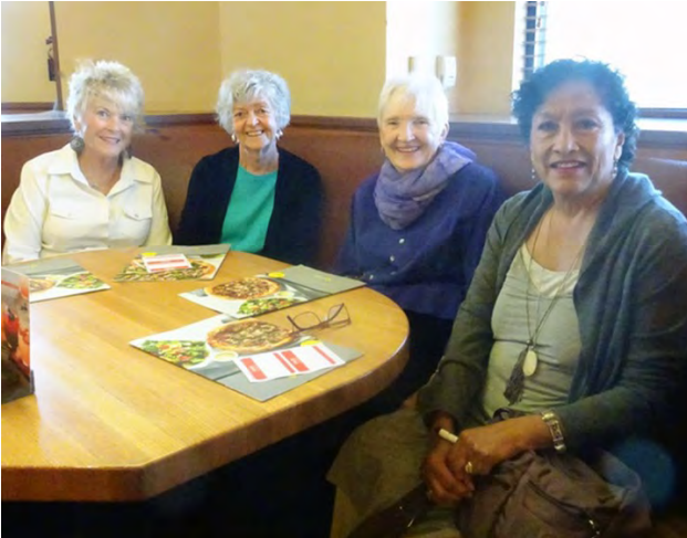
Theater Goers Brunch at the California Pizza