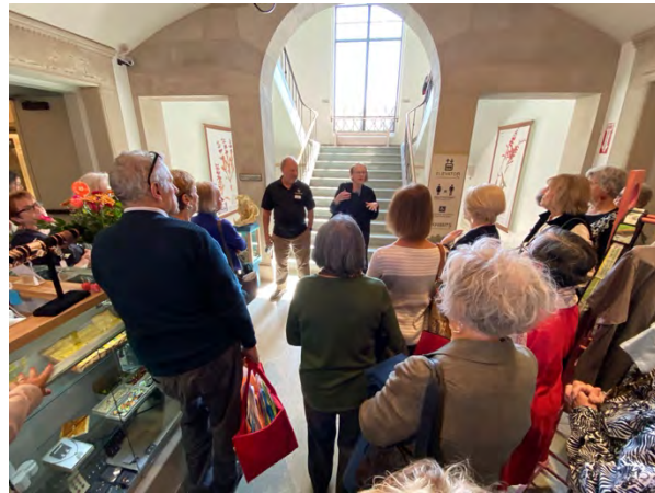
followed by a tour of the CU Natural History Museum