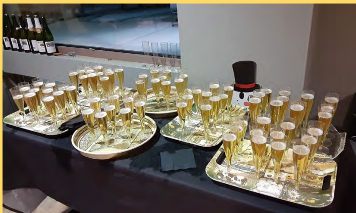
Awaiting the Toast to 100 years!