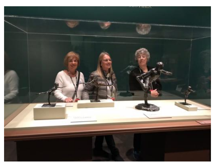
Viewing some of Degas sculptures.