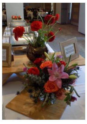
Lovely flowers with food service