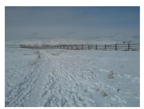
Coot Lake area.