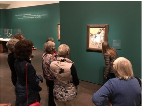
Viewing one of Degas' Dancers paintings.

UWC On the Road Again met at the Denver Museum of Art on February 27 for a docent-lead tour of the "Degas: A Passion for Perfection" exhibit.