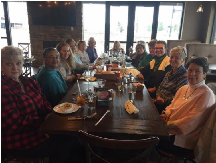
Out to Lunch Bunch