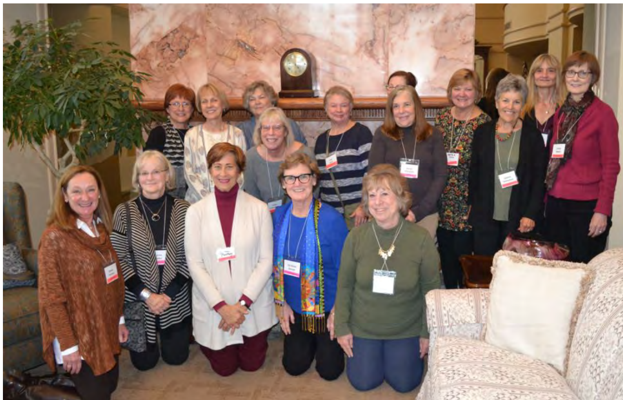
New Members who attended the New Member Wine and Cheese Reception