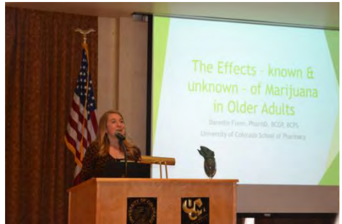
Topic: The Effects—known and unknown—of Marijuana in Older Adults