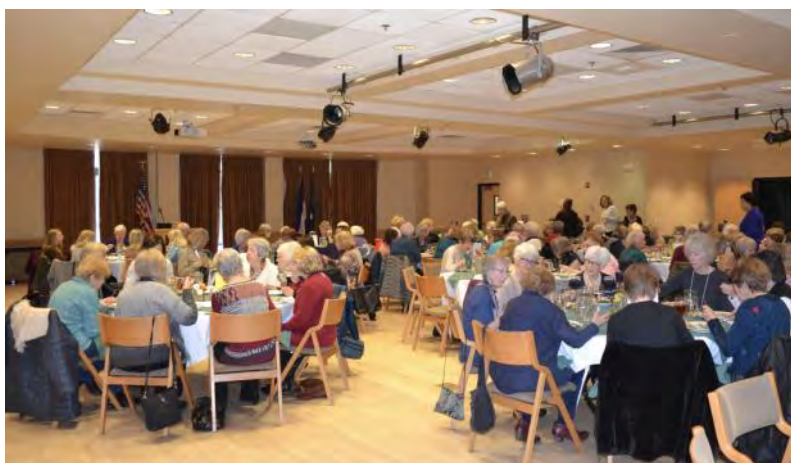
Full room of UWC members and guests