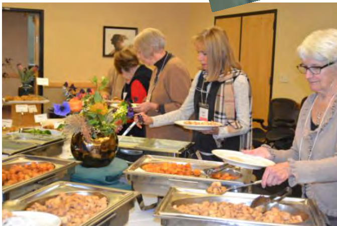
Thai food was served.