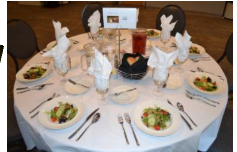
Table setting with salad course