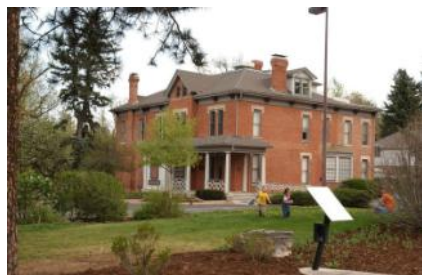
Koenig Alumni Center on the corner of Broadway and University in Boulder