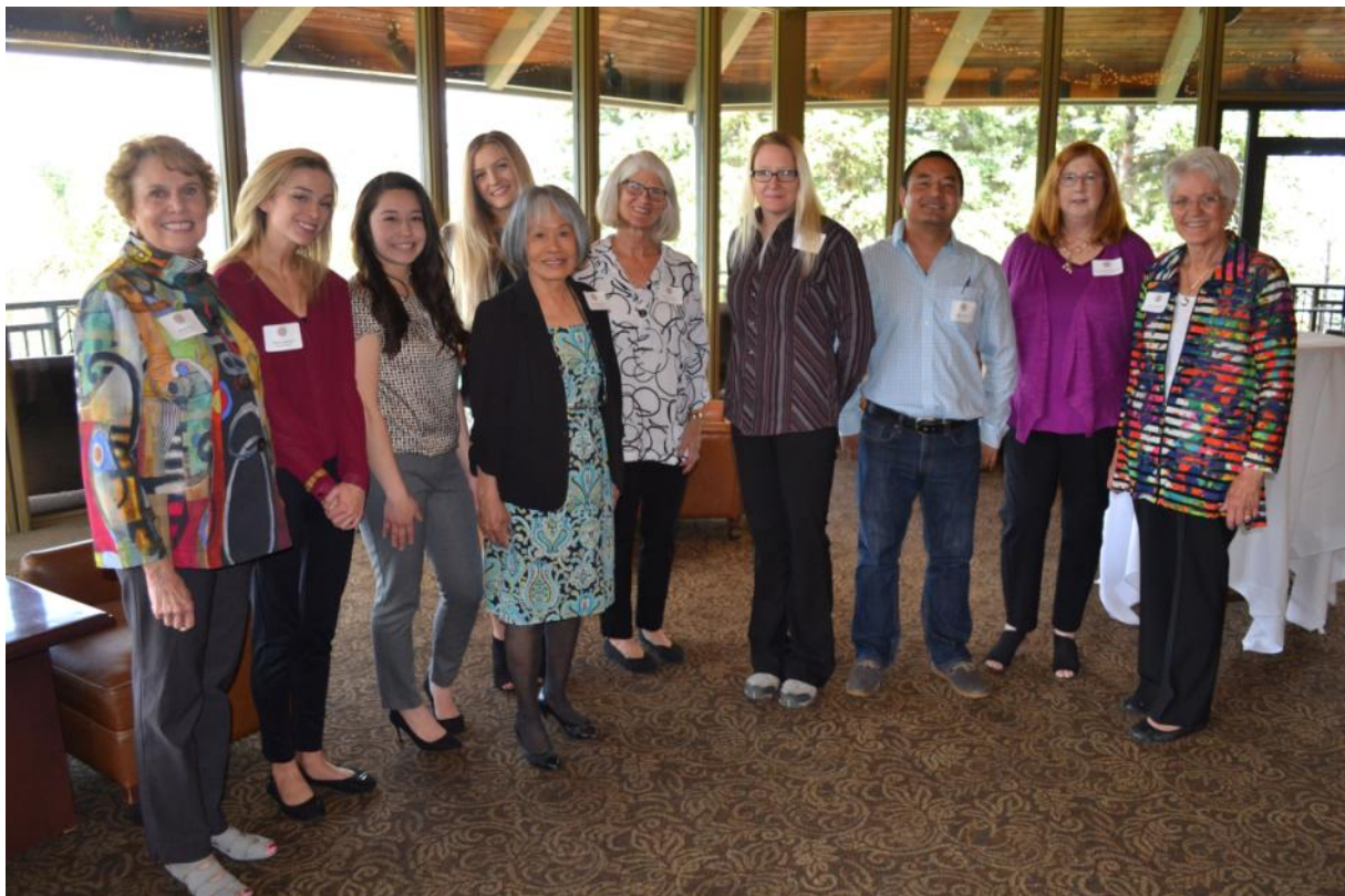
Scholarship winners and Scholarship Committee