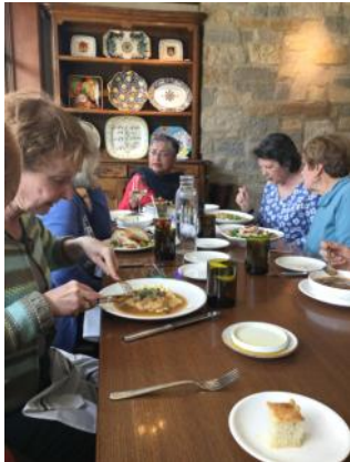
Out to Lunch group ^ | v