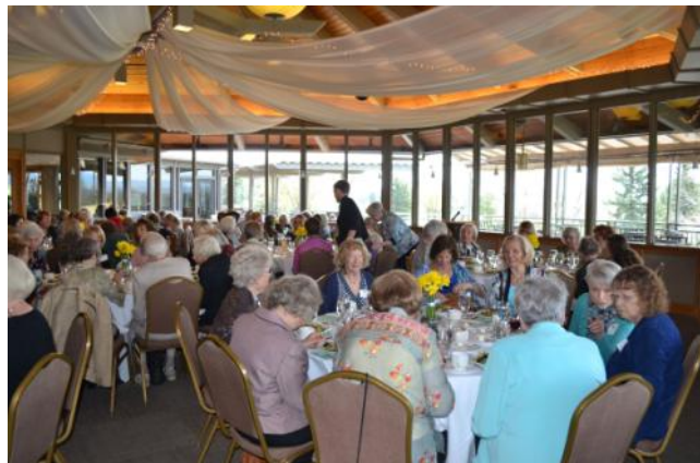
Boulder CC with room full of UWC members, guests, and Scholarship recipients