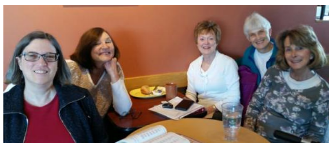
French Conversation Group—all speaking levels