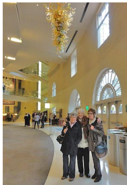
Theater Goers after seeing "An Act of God" at the DCPA in February.