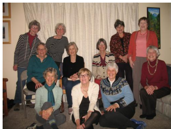
Evening Book Group