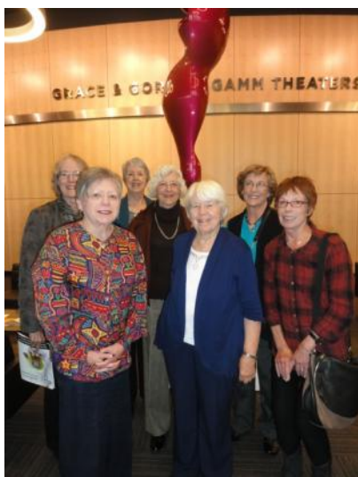
Theater Goers at the Grace and Gordon Gamm Theater

This is a very small theater, so please book your ticket early.