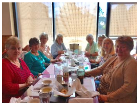
Book Group at Jewel of India