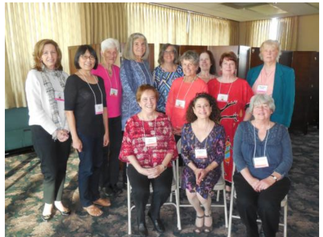
New members who attended.