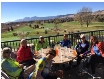
Bikers at Lake Valley Golf Club