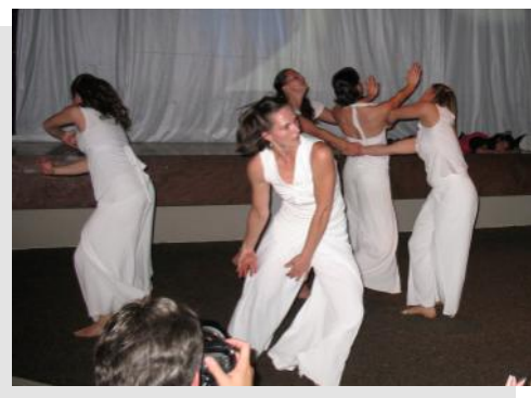
Dance Performance by 3 rd Law Dance/Theater

drawn from Henry Moore's ideas on art. (See photos.)