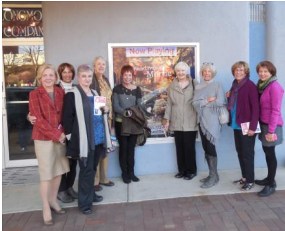
Tuesdays with Morrie