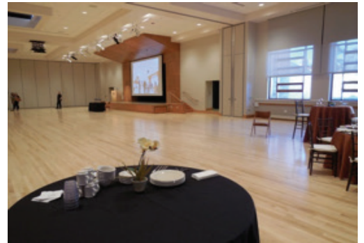
Center ballroom, including stage

The ballroom can be partitioned into three sections. The East and the West ballrooms have about the same capacity as UMC 235. The center ballroom is quite large. The AV, lighting, and air temperature controls are impressive. The Ballroom was dedicated in 1953 and was in great need of this upgrade.