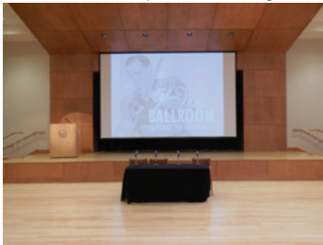
Stage and screen in ballroom