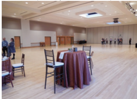
Center ballroom from corner