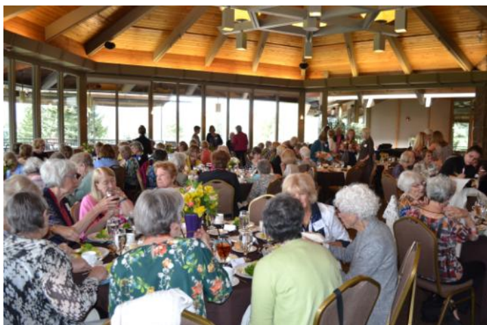
Full house at the Boulder Country