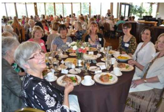
Delicious food. Lovely table settings.