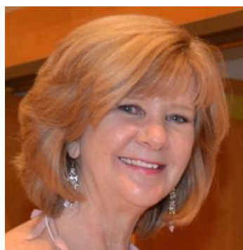
Webmaster: Carol Etges