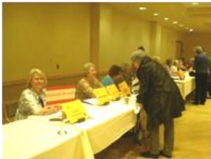
23 interest groups ready for sign-ups.