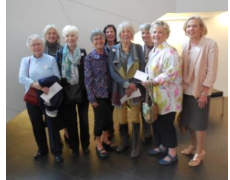
Members attending exhibit