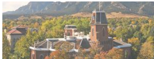
Views of Old Main