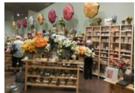
In Bloom Gift shop