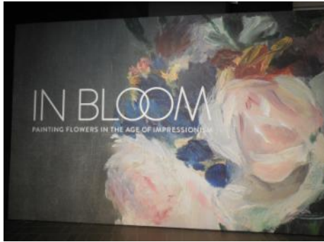
In Bloom wall outside exhibit

The exhibit included paintings of flowers from famous artists which had been loaned to the exhibit from museums all over the USA and Europe.