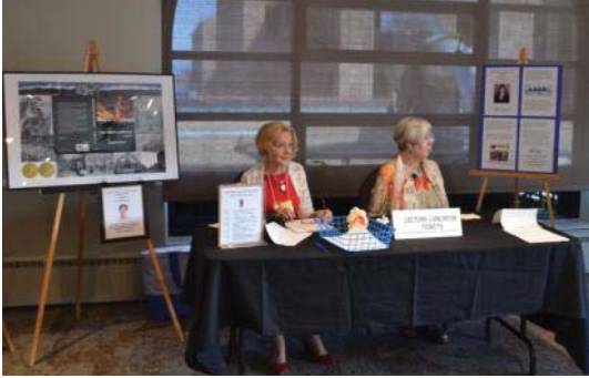
Lecture Registrations here