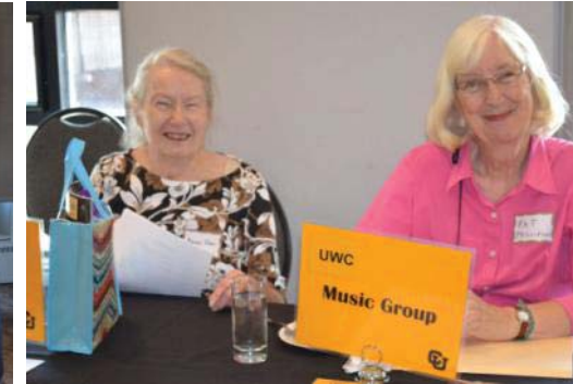
Needlecraft and Music Group Chairs