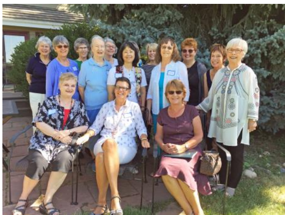
Interest Group Chairs 2015-16

Learn more about our interest groups at the September 8th Membership Coffee.